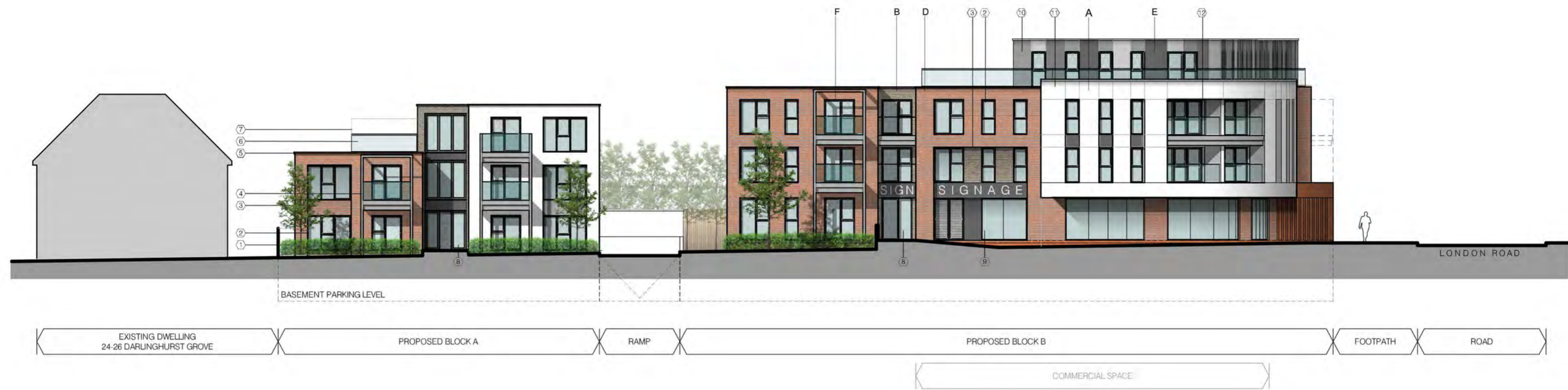
PROPOSED INDICATIVE STREET-SCENE [DARLINGHURST GROVE] SCALE: 1:200@A2

Please note any work carried out before building regulation approval is at the contractor's own risk.